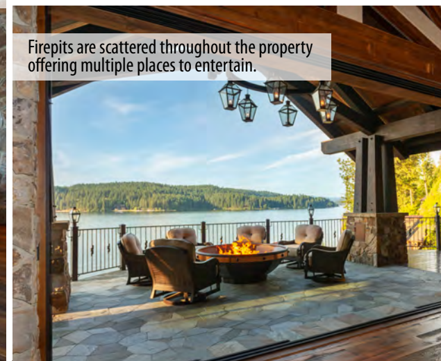
Firepits are scattered throughout the property offering multiple places to entertain.

Oversized sunken bar and entertainment area with granite and leather rail details, plenty of seating, and a massive quad television, offering the option to play 4 different channels at the same time.