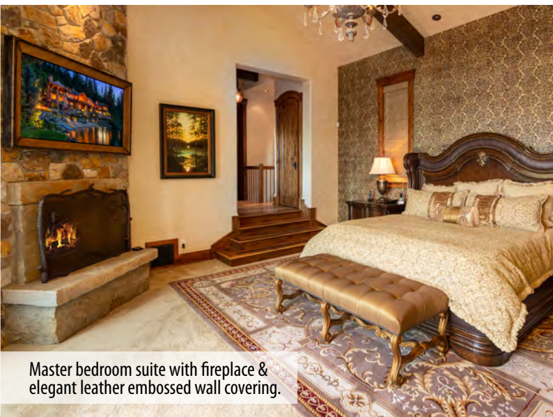
Master bedroom suite with fireplace & elegant leather embossed wall covering.