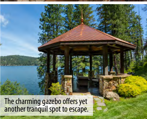
The charming gazebo offers yet another tranquil spot to escape.