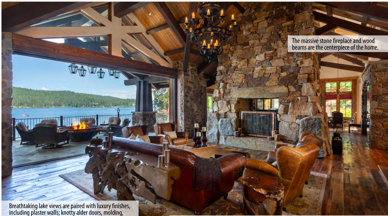
The massive stone fireplace and wood beams are the centerpiece of the home.

Breathtaking lake views are paired with luxury finishes, including plaster walls; knotty alder doors, molding, cabinets and casework; historic oak floors; wood ceilings; a unique variety of stone countertops; and copper wall paneling in the office.