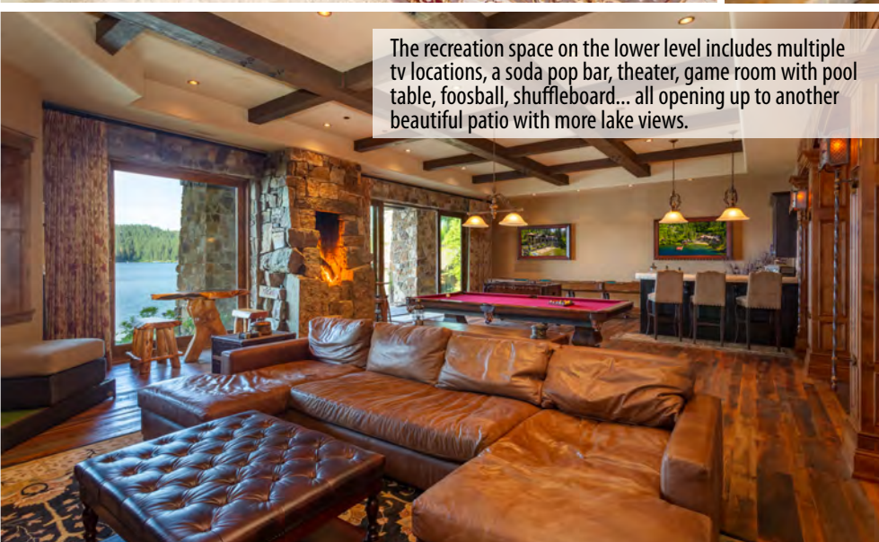
The recreation space on the lower level includes multiple tv locations, a soda pop bar, theater, game room with pool table, foosball, shuffleboard... all opening up to another beautiful patio with more lake views.