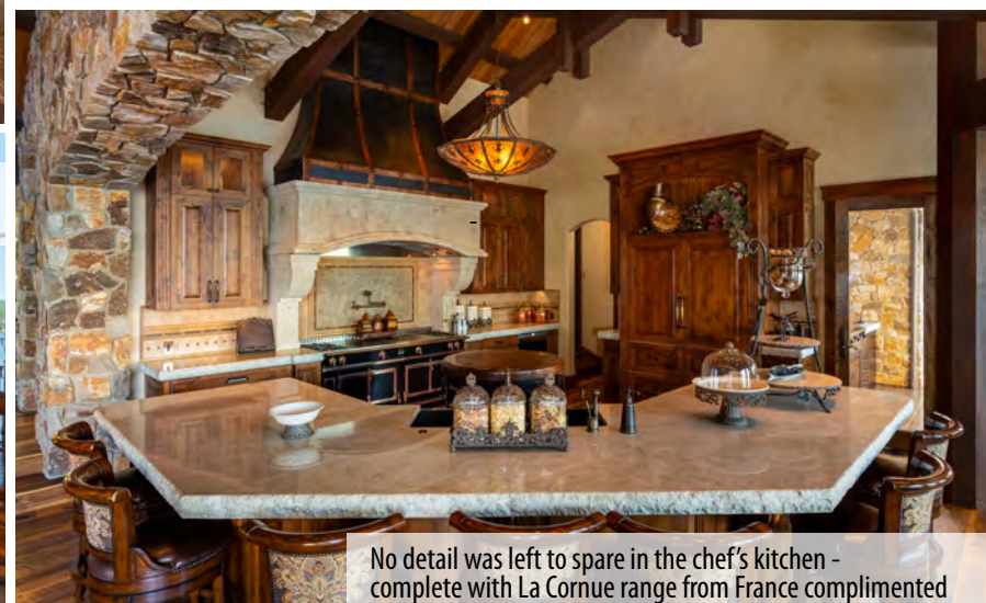
No detail was left to spare in the chef's kitchen - complete with La Cornue range from France complimented by an oversized hood, marble countertops with giant edge detail, and vaulted T&G ceilings.