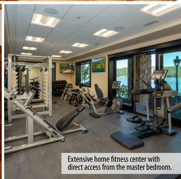
Extensive home fitness center with direct access from the master bedroom.