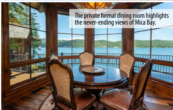
The private formal dining room highlights the never-ending views of Mica Bay.

Breathtaking lake views are paired with luxury finishes, including plaster walls; knotty alder doors, molding, cabinets and casework; historic oak floors; wood ceilings; a unique variety of stone countertops; and copper wall paneling in the office.