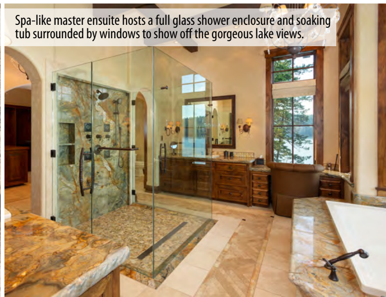
Spa-like master ensuite hosts a full glass shower enclosure and soaking tub surrounded by windows to show off the gorgeous lake views.