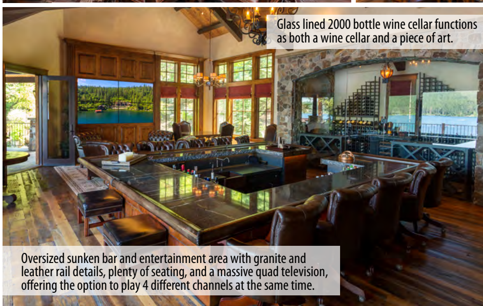
Glass lined 2000 bottle wine cellar functions as both a wine cellar and a piece of art.

Oversized sunken bar and entertainment area with granite and leather rail details, plenty of seating, and a massive quad television, offering the option to play 4 different channels at the same time.