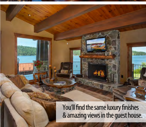
You'll find the same luxury finishes & amazing views in the guest house.